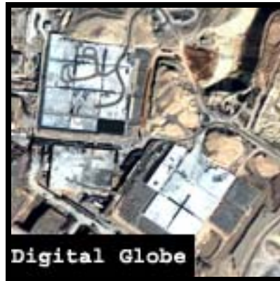
Figure B February 2003