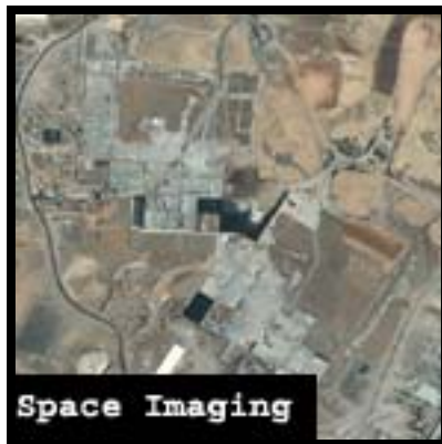
Figure C June 2003