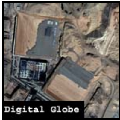
Figure A September 2002