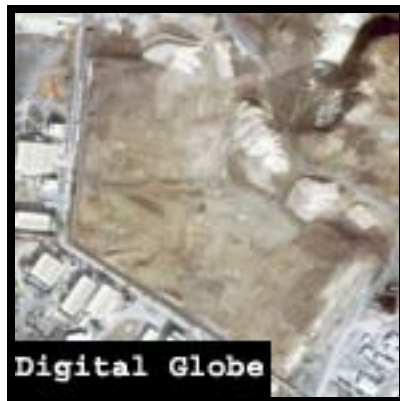
Figure D January 2006

The above images depict the progression of the covering of buried facilities that are at the core of the Fuel Enrichment Plant at Natanz.