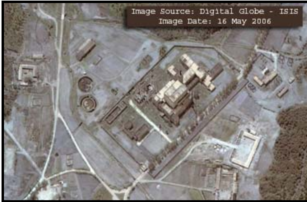
50 MWe reactor at Yongbyon.