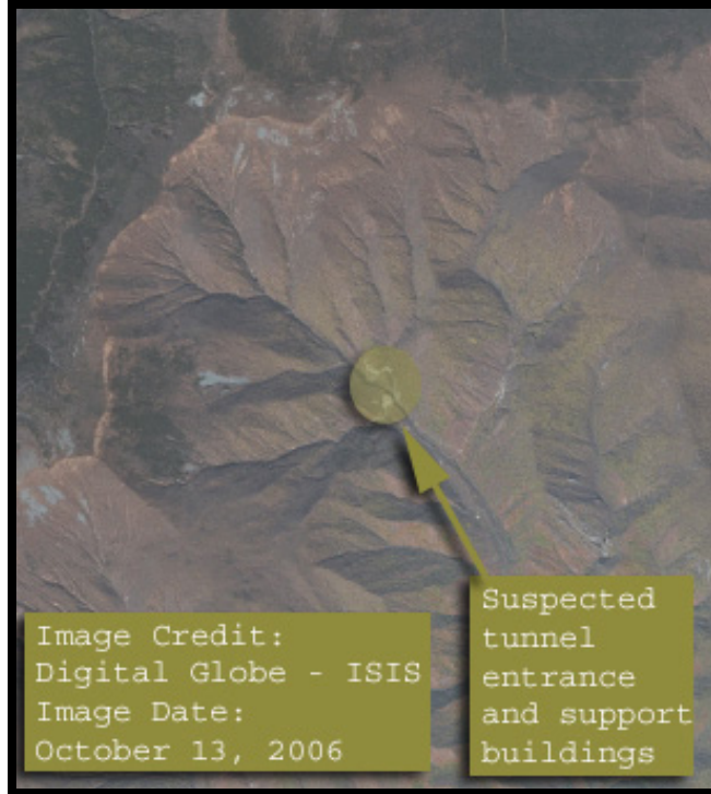
Overview of suspected North Korean nuclear test site collected after the test