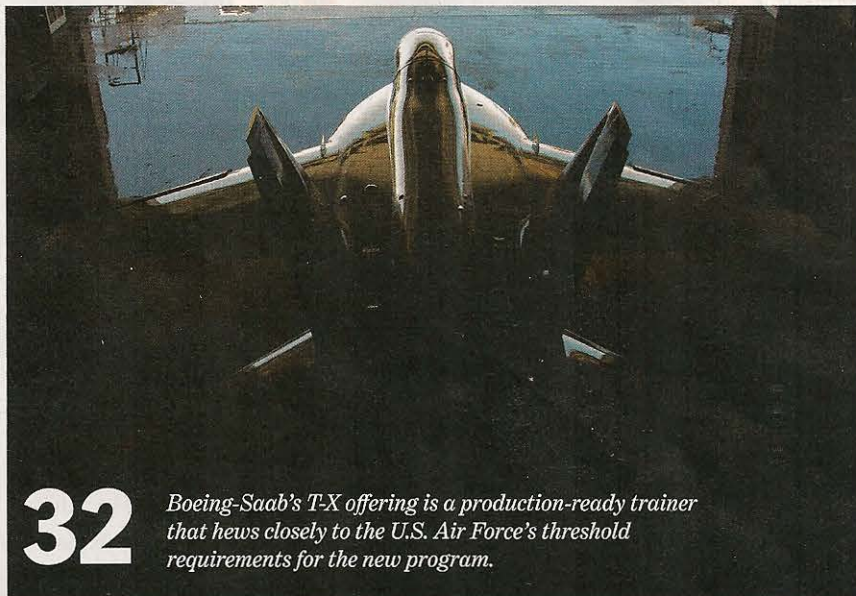
32 Boeing-Saab's T-X offering is a production-ready trainer that hews closely to the U.S. Air Force's threshold requirements for the new program.