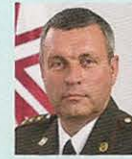
Lt. Gen. Leonids Kalnins, Chief of Defence of the Latvian Armed Forces